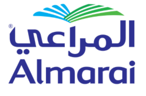
ortner Technical Partner