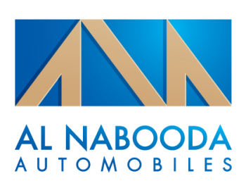
ion Partner Venue Partner